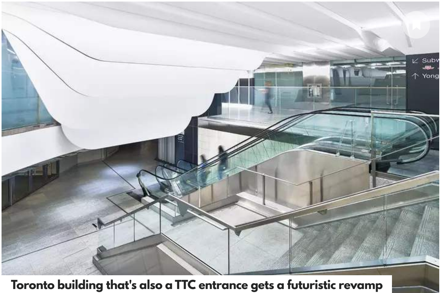
Toronto building that's also a TTC entrance gets a futuristic revamp