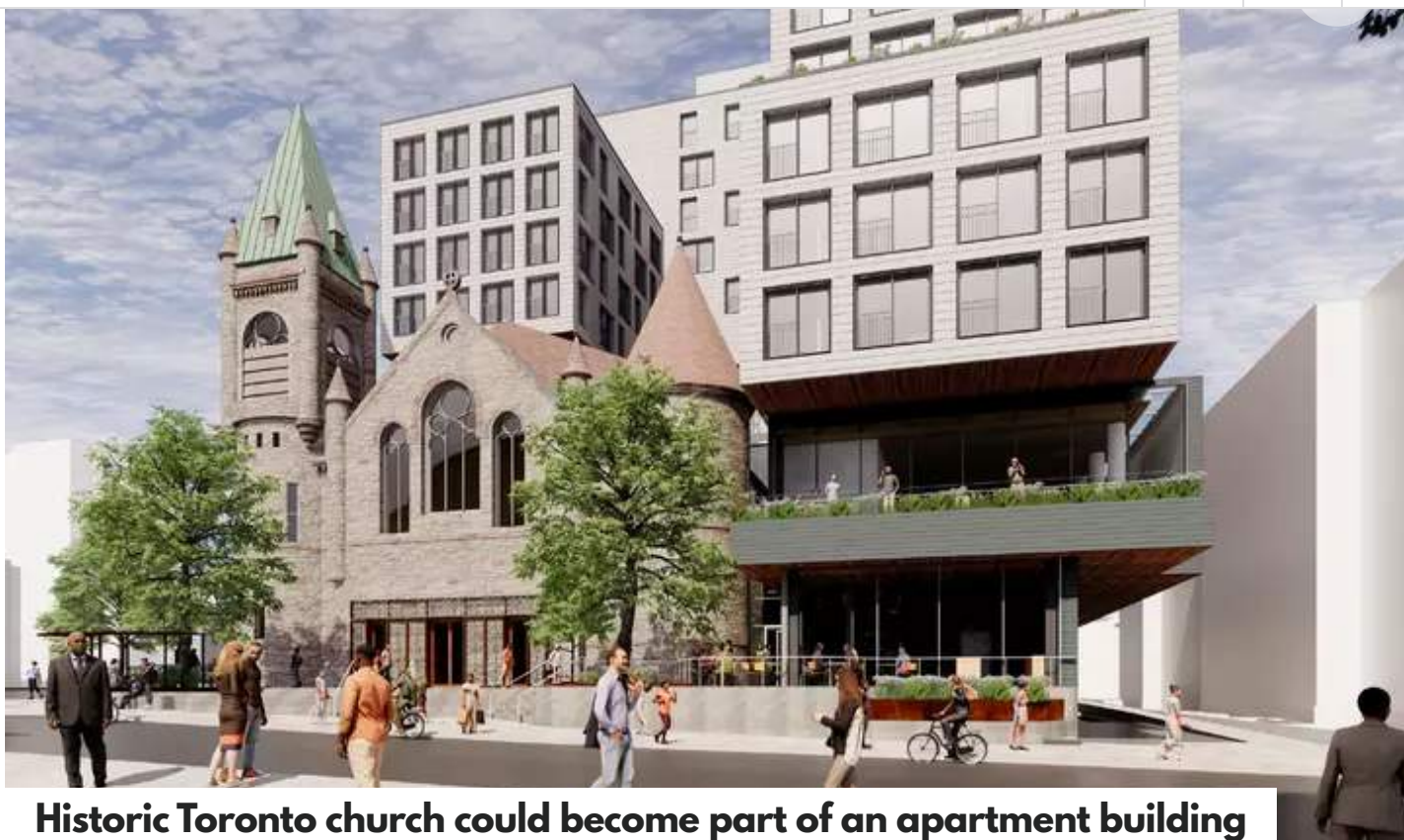
Historic Toronto church could become part of an apartment building development