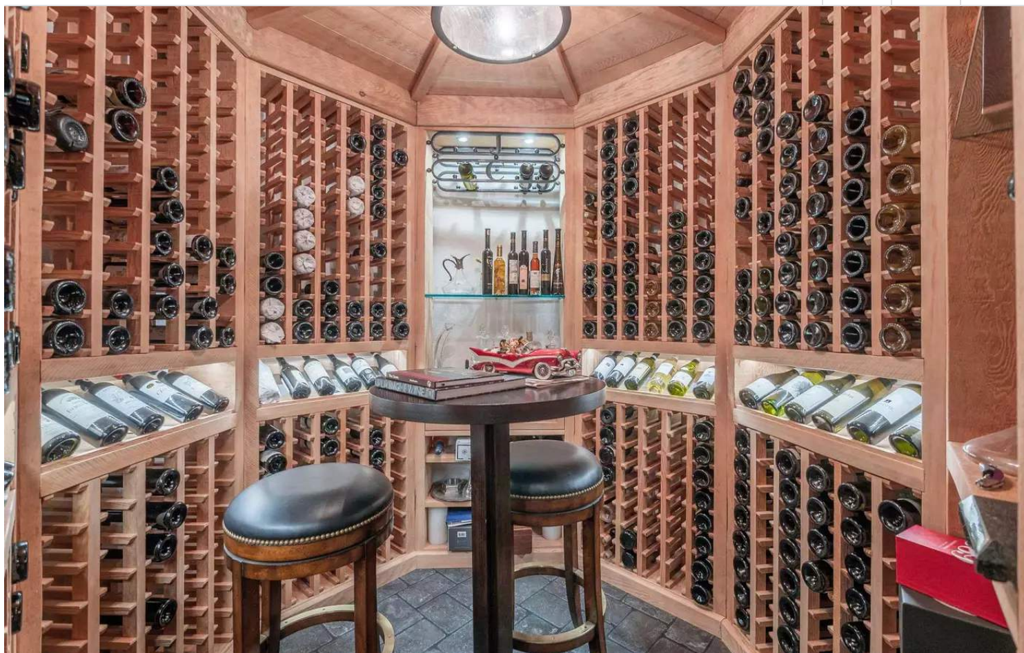
The custom wine cellar.

The lower level of this home features all the must-have bonus rooms, most notably a stellar wine cellar, as well as other snazzy additions to this home include an elevator and car lifts in the garage.