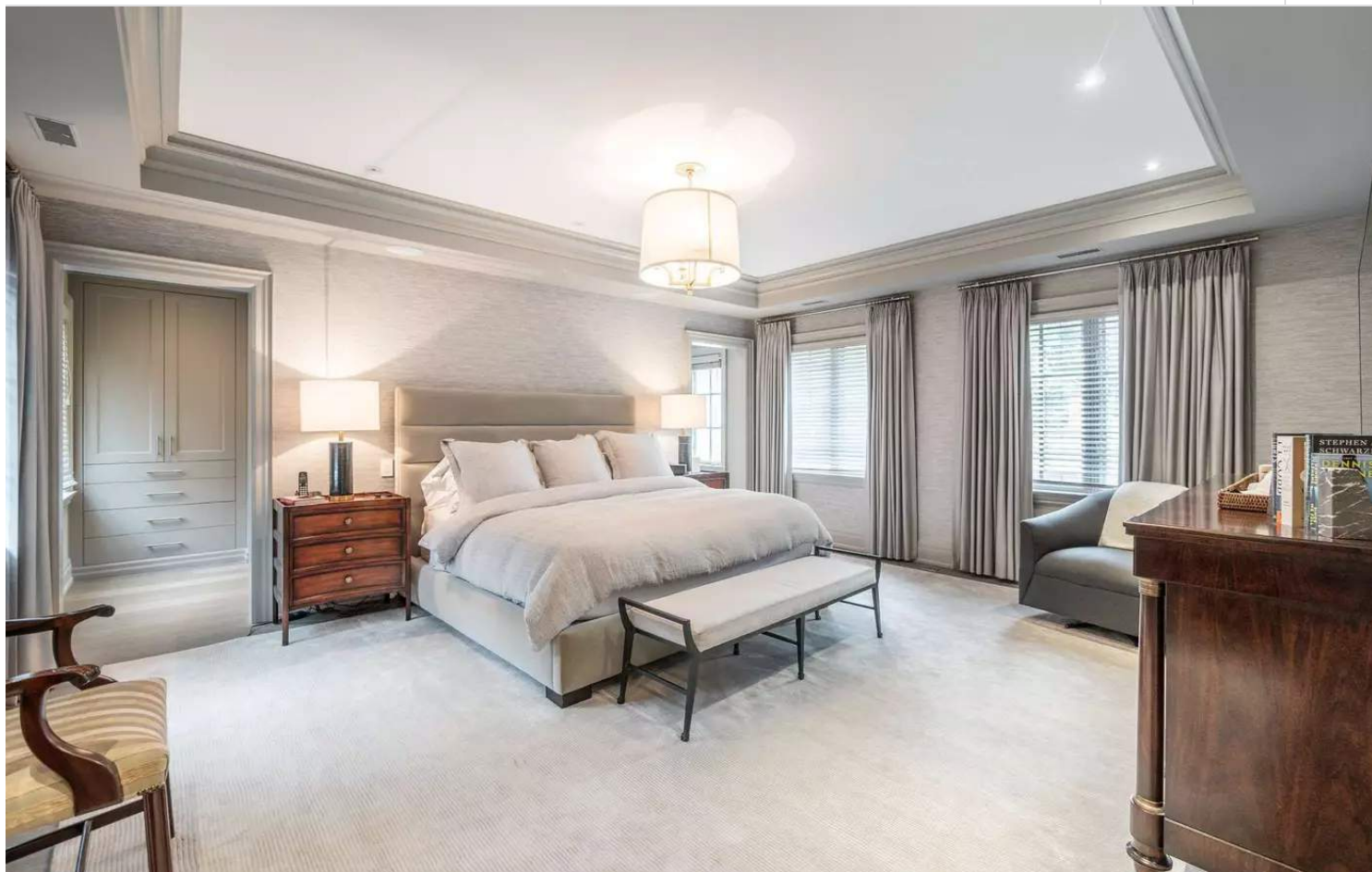
One of the primary bedrooms.

The home has four bedrooms, seven bathrooms and is filled with luxurious touches throughout.