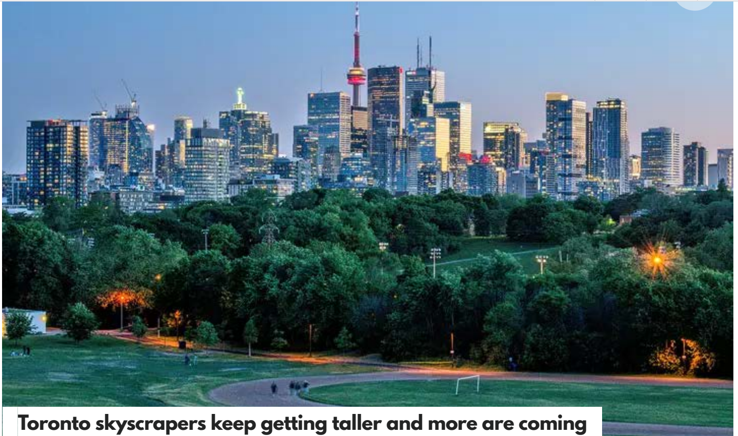
Toronto skyscrapers keep getting taller and more are coming