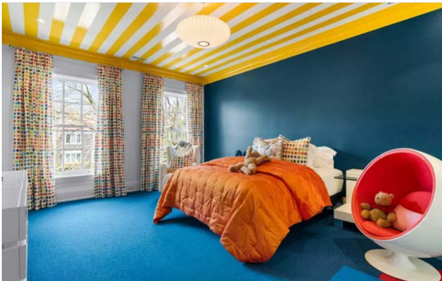
One of the bedrooms.