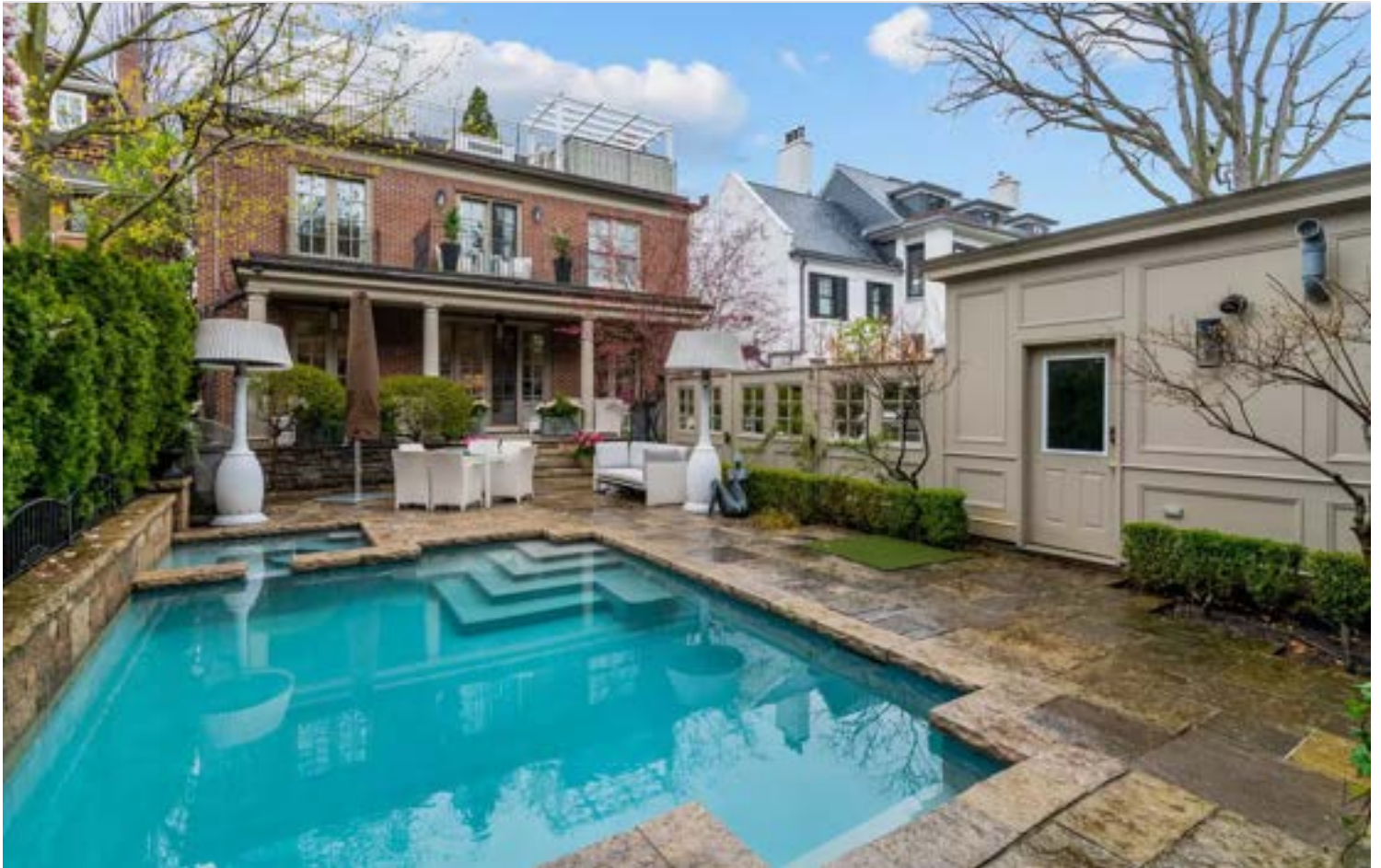
The backyard with the inground pool.

"[This] is truly one of the best properties to come to the market in a while," concludes realtor James Warren.