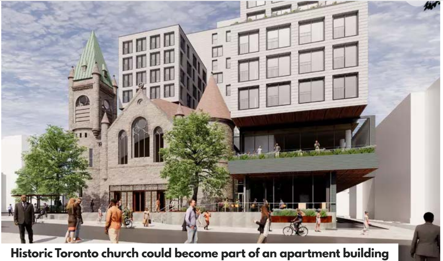
Historic Toronto church could become part of an apartment building development