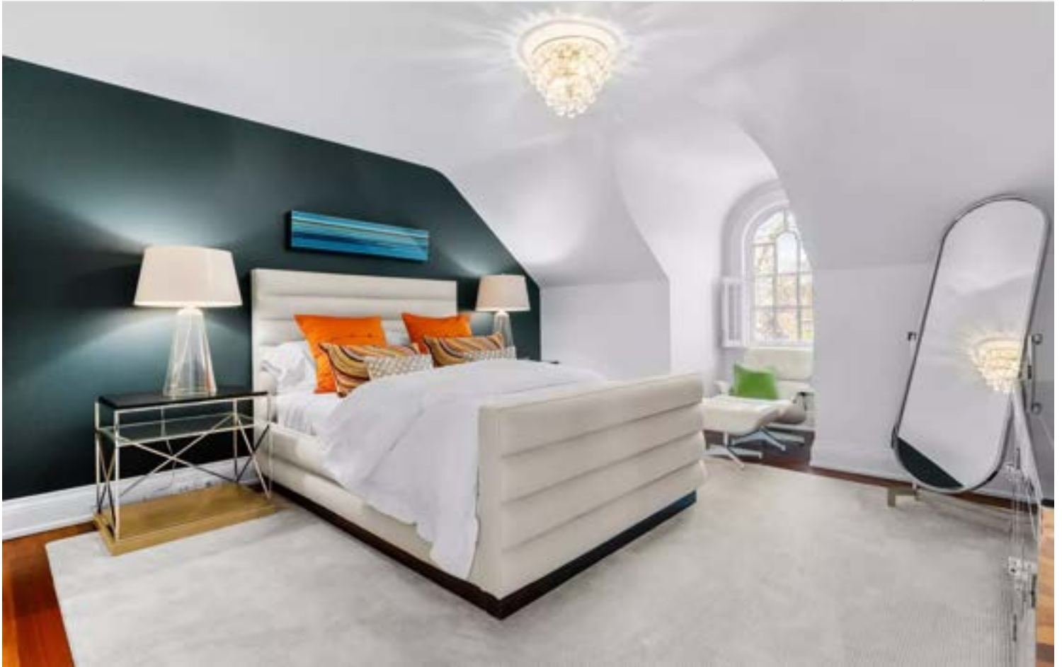
One of the bedrooms on the third floor.

It has five bedrooms, seven bathrooms and over 7,000 square-feet of living space. All pretty bog standard when it comes to Rosedale homes.